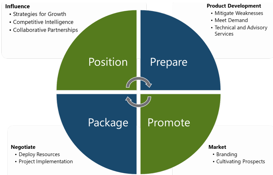
Figure 1: Roles of an Economic Development Organization

The roles that EDOs serve vary from community to community. In some jurisdictions, a single organization, public or private, might be expected and empowered to do it all, from forming the overall economic growth strategy, to developing the product (such as office space and shovel-ready sites) and providing technical assistance, to marketing and branding their communities, working prospective business leads to negotiation of deal financing and incentives.