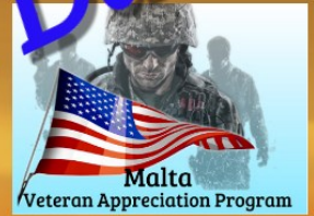
Malta Veteran Appreciation Program