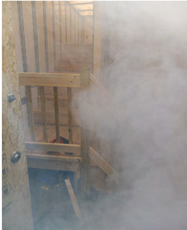
Tactical training trailer at Altamont Fair

This is the monthly newsletter for the Albany County Sheriff's Office Critical Incident Emergency Management Unit. Please feel free to send us your comments and suggestions.