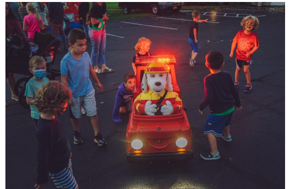
Shaker Road Fire