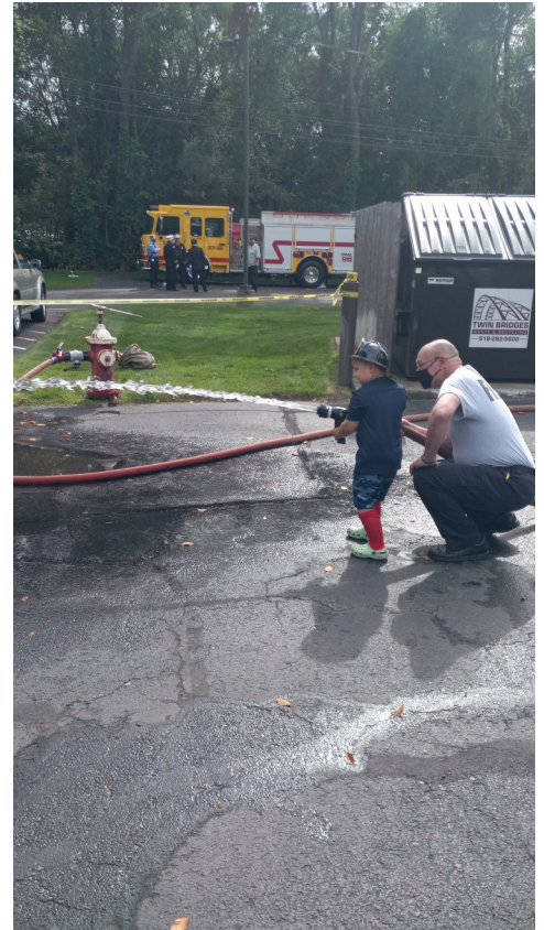
Fort Hunter Fire

Training Article: What words of wisdom would you tell your rookie self?