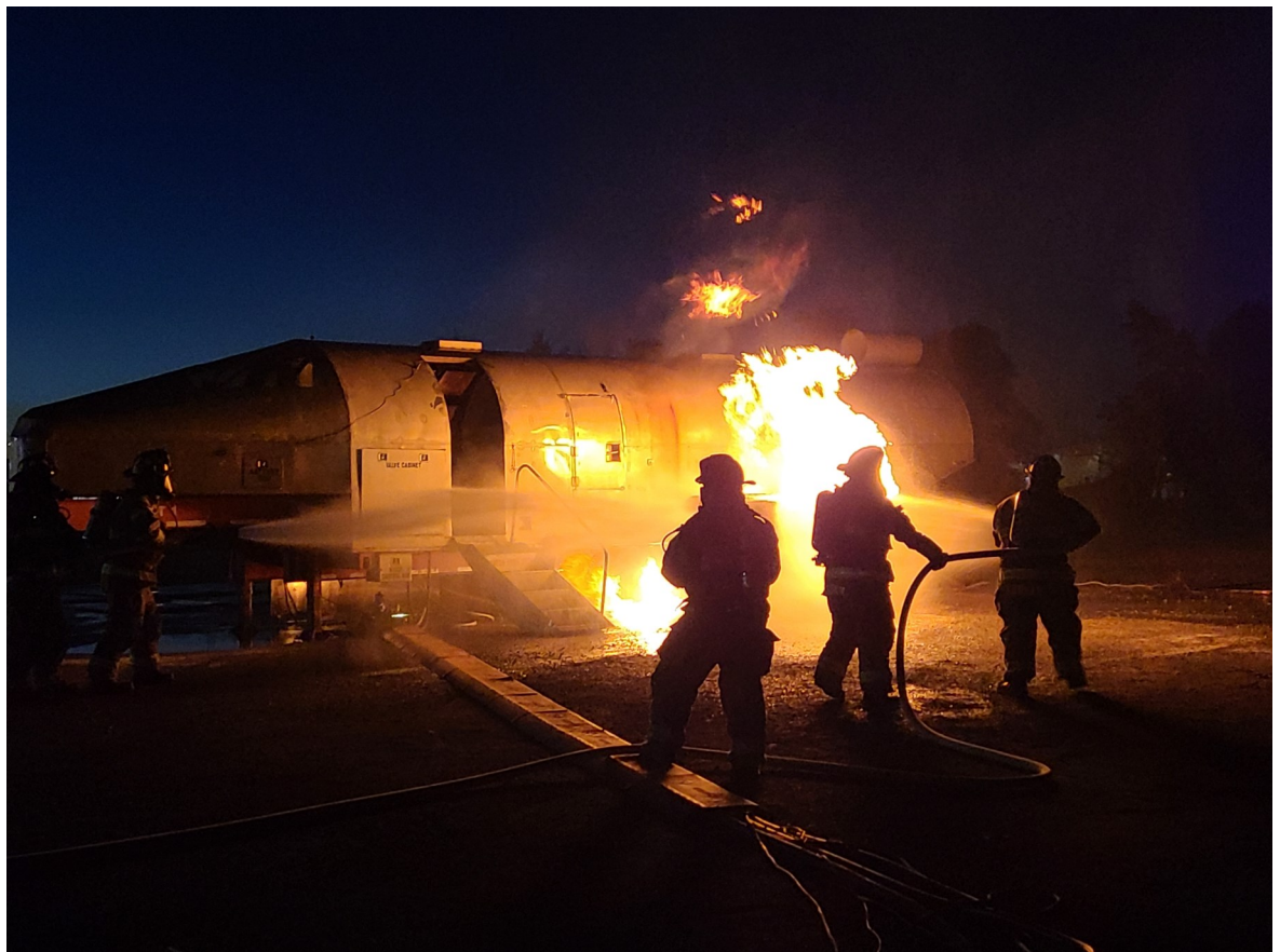
Live fire training Albany International Airport Fire Department

This is the monthly newsletter for the Albany County Sheriff's Office Critical Incident Emergency Management Unit. Please feel free to send us your comments and suggestions.