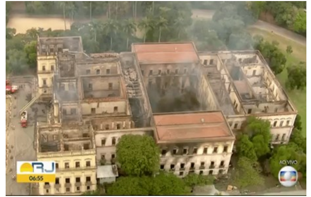
2018 Brazil museum fire: 'incalculable' loss as 200-year-old Rio institution gutted By Guardian News Website