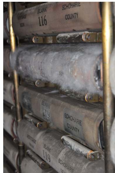
2011 Mold growing on volumes of mortgages Schoharie County