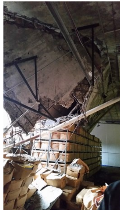
Roof collapse and water pipe break at Riverview Center in Menands 2016

Office of Emergency Management P.O. Box A 58 Verda Ave. Clarksville, NY 12041