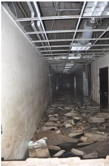
2011 Flooded Basement Schoharie County building