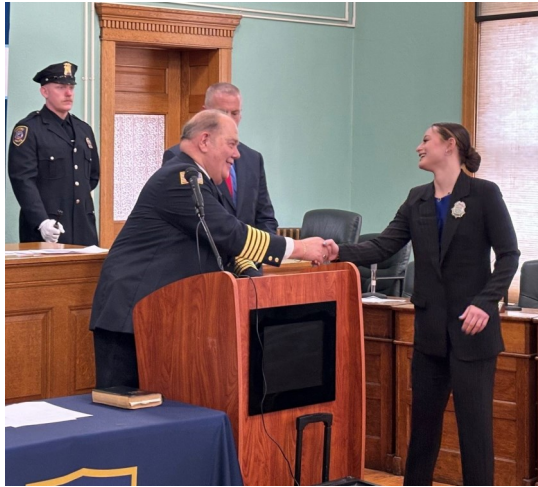
Swearing in ceremony Cohoes Fire Department March 20th